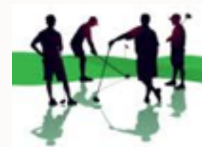
Together, teamwork will...