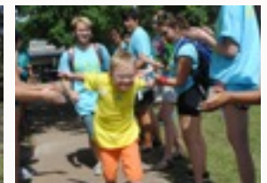
we'll celebrate with every one who comes to camp!