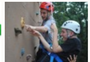
help a camper climb higher