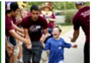
...Bless a special camper!