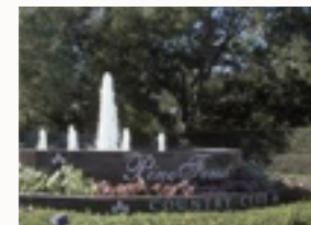
Celebrate the golf day with an outstanding meal...