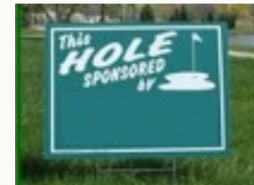
Your sponsorship will..

Includes 1 foursome; Recognition at Awards Ceremony, lunch and dinner for team. Will need to enter Team Captain's full name at register online.